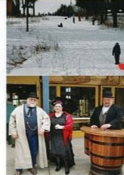
(right bottom) Wildcatter Day at Pithole opens the season in June.