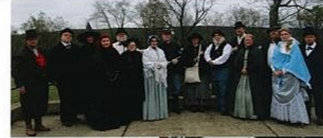
(above) Volunteer reenactors lead ghostly tours by lantern light biennially in October.

Hours and rates are subject to change. Please contact us for additional event information.