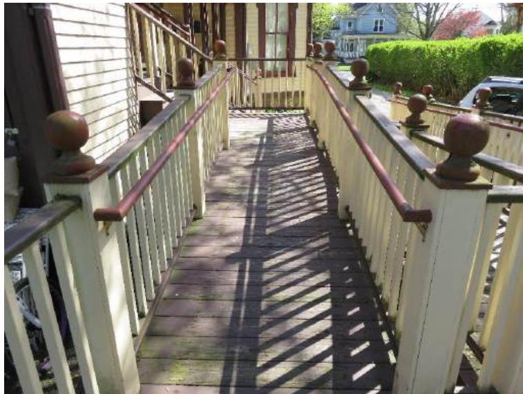
Upper Half of ADA Ramp, from Ramp Landing