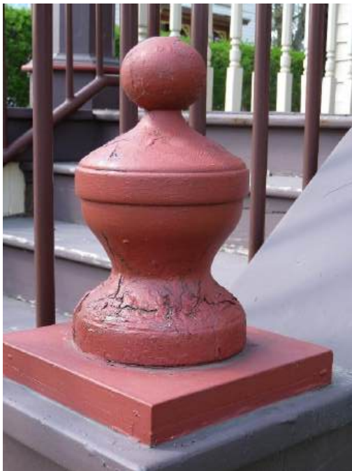
Original Cast Masonry Finial at Base of Front Porch Steps