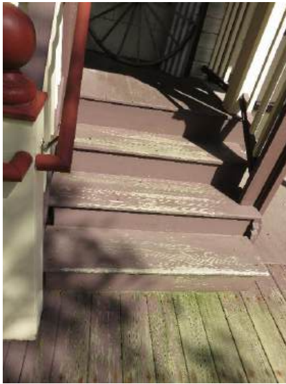
Outdoor Stairs to Apartment