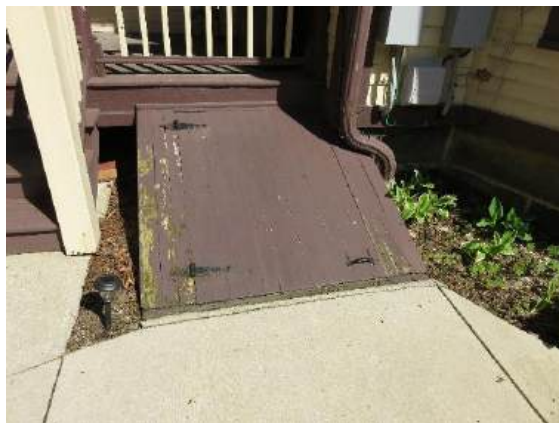
Access Door to Basement