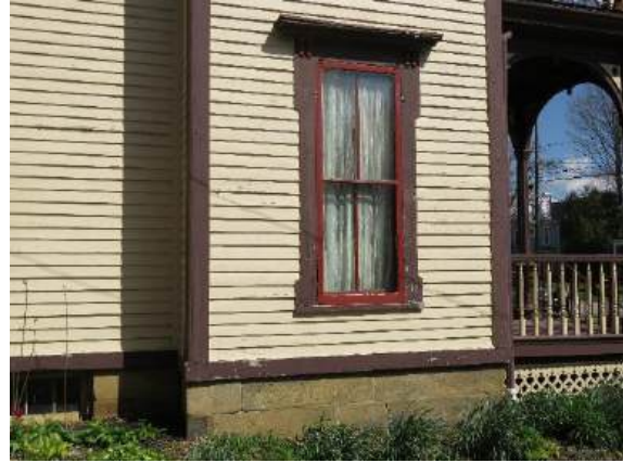
Storm Window over West Window