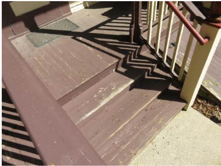
Stairs and Side Porch (West Face)