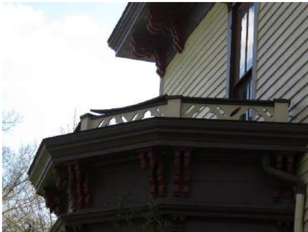
Warped Railing over East Bay Set