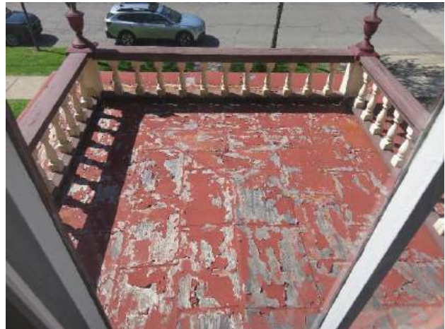
Metal Roof over Front Porch