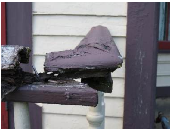
Railing Corner of Front Deck