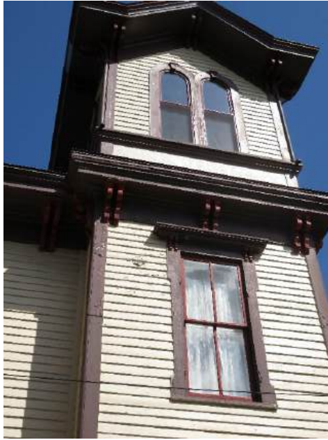
West Face of Cupola