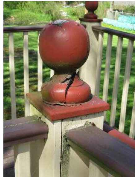
Split Finial to be Repaired or Replaced (Ramp)