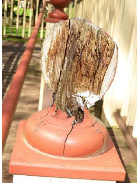
Rotted Wood Finial to be Replaced (Ramp)