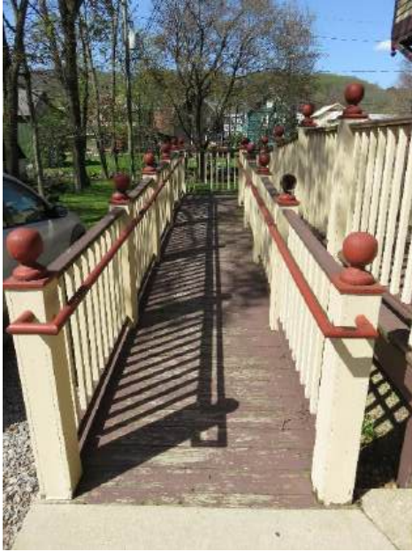
Looking up ADA Ramp to Ramp Landing