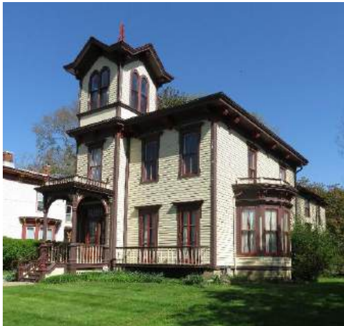
South and East Elevations

These pictures show a representative sample of the exterior wood, metal, and other components of the exterior of Tarbell House owned by Oil Region Alliance (ORA). These pictures are not a comprehensive indication of the carpentry repairs and repainting included in the scope of work for this Request For Quotations (RFP). Interested contractors are encouraged to visit project site for closer examination of current exterior conditions. No appointment is necessary; OK to take own photos.