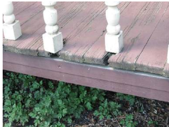
Railing Spindles of Front Deck