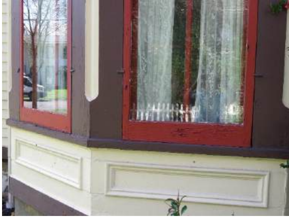
Storm Windows over East Bay Set