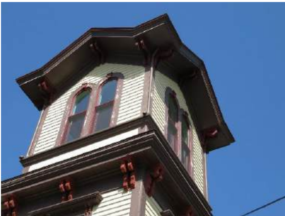
South and East Faces of Cupola