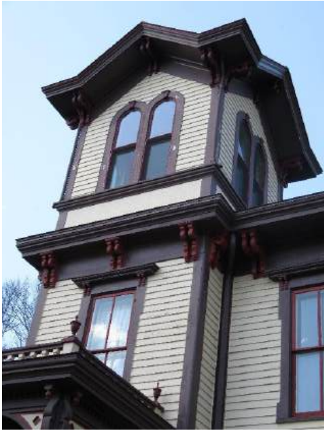
Front (south) Face of Cupola